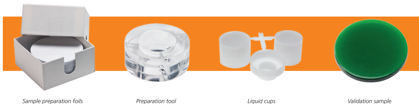
Sample preparation foils