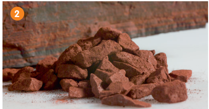
Solids and irregularly shaped samples