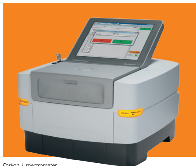
Epsilon 1 spectrometer