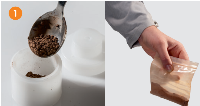
Loose powder in disposable cup or plastic bag