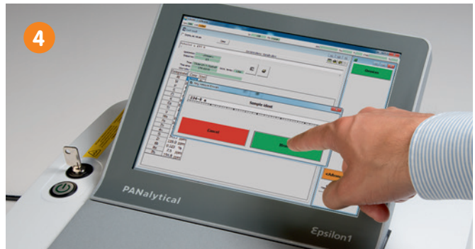
Enter sample name and touch the 'measure' icon.