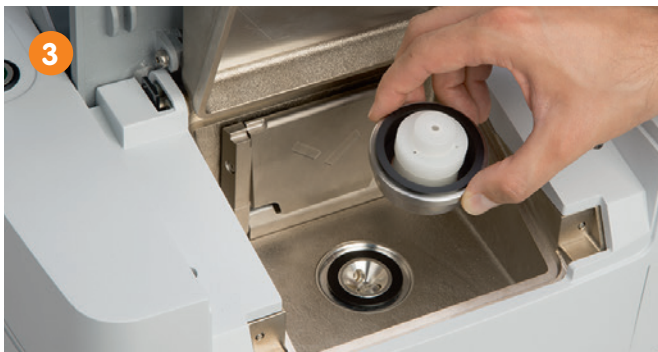
Place your sample for measurement.